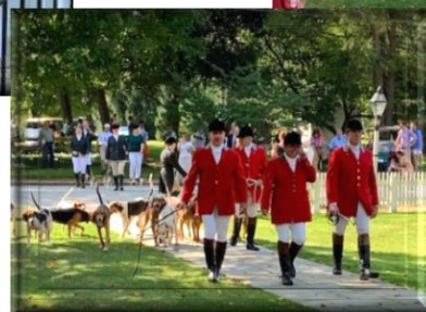
2019 Blessing of the Hunt