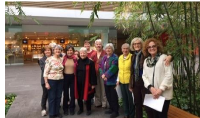
March Lenten Art Retreat